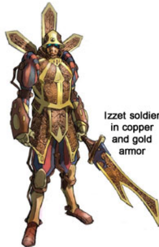
Izzet soldier in copper and gold armor

As you can see below, the wizards of the Izzet guild dress in flamboyant and alchemically-boostered clothing. This guild is funded by a dragon's hoard, after all -- a dragon who has lived for thousands of years. Think of the compound interest! You can see examples of Izzet wizards on cards like Izzet Guildmage , Izzet Chronarch , Stitch in Time and Tibor and Lumia .